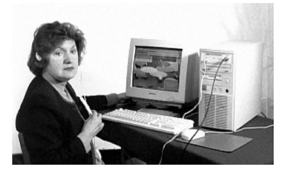
Fig. 3. The system equipment used during the medical procedure

For adequate simulation of high-frequency structure of the cosmic microwave background the hypothesis of the defining role in formation of amplitude-frequency structure of microwave radiation of the low-frequency fluctuations of a natural origin caused by processes of explosive character [12] was made