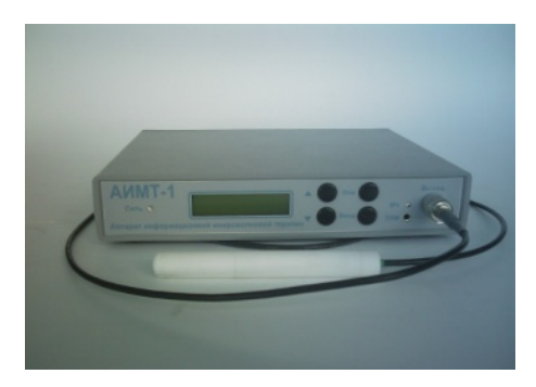
Fig. 2.The device of information microwave therapy

The most perspective of them at practical use in National Health Service and in everyday life are autonomous (Fig. 2) and IBM compatible (Fig. 3) hardware and software for recovery of disturbed organism homeostasis by means of electromagnetic radiations of microwave range (range of frequencies (4,0–4,3 GHz).